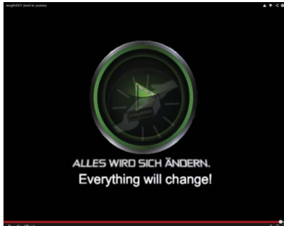
Video 2: bring.Buddy http://www.youtube.com/watch?v=fwhbij0tDyw

Last fall, logistics giant DHL announced a pilot last-mile crowdshipping service in Stockholm called MyWays. People who make online purchases and are interested in “flexible delivery” would be able to specify their delivery time and place, and the fee they’re willing to pay for it. The request uploads to a smartphone app, where potential deliverers in Stockholm can see it and decide whether they’re willing to pick up the package at a DHL facility and take it to its final destination for the price indicated by the buyer. The service targets drivers who regularly commute past a DHL facility and are interested in earning a little extra money.